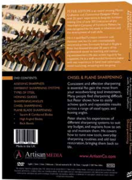
The reverse of the Chisel & Plane Sharpening DVD

The explanation and coverage of the different types of honing options is very rational and follows along my own lines to some extent